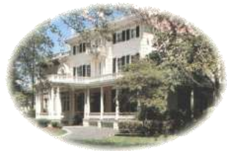
Glen Foerd Mansion